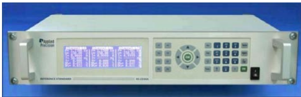
Reference Standard 2x30 (front view)