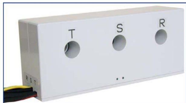
Current Extender 240 / 5 A CE 1324B