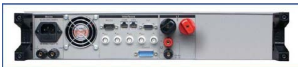
Reference Standard 2130 (back view)