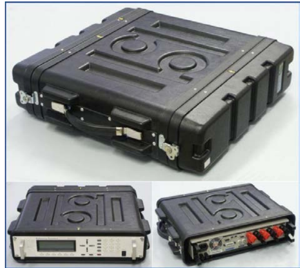
Transport Case RSTC 1000