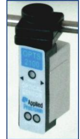
Optical sensor OPTS 2100