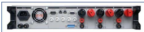
Reference Standard 2330 (back view)